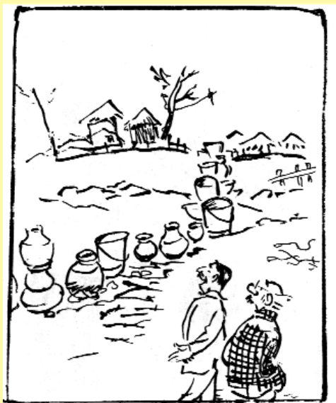
Not bad! One of the taps in the nearby village must be getting water!

What approval or disapproval is being expressed here?